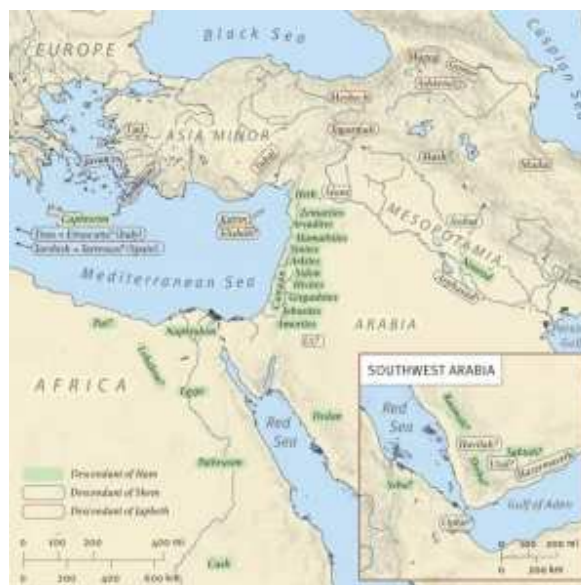
Table of Nations (67)

Other strengths include the introductory articles and book introductions. Much like the NLTBSB, the ESVSB went above and beyond the usual 1-2 paragraph book introductions in providing 2 page (e.g. Habakkuk) to 10 page (e.g. Revelation) introductions that provide the following information: